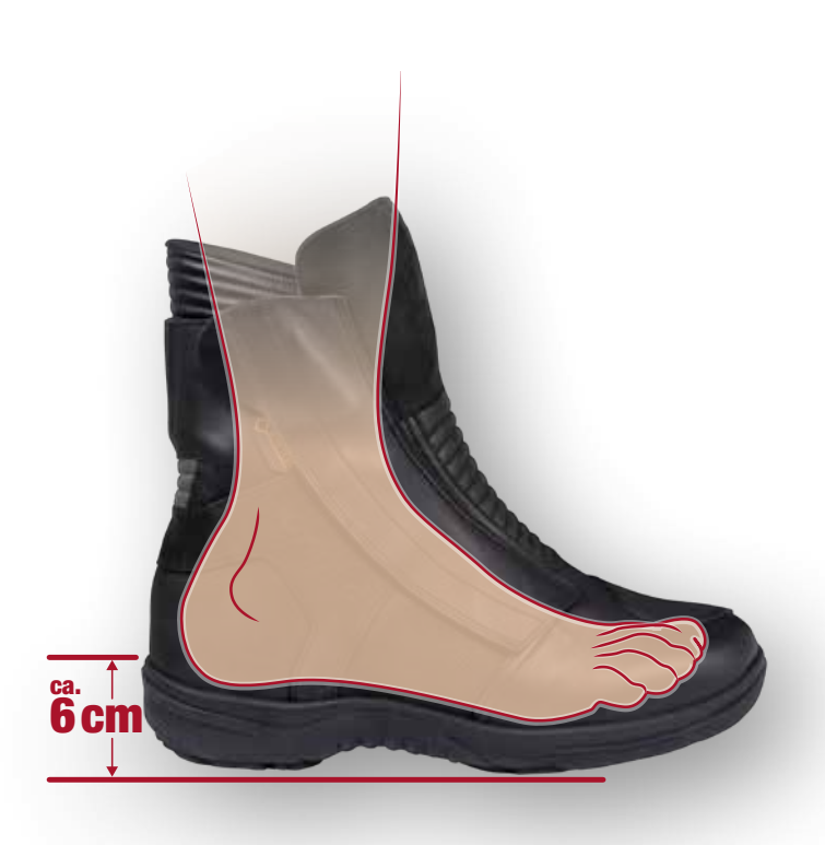
6 centimetres higher thanks to internal cork sole elevation with leather cover